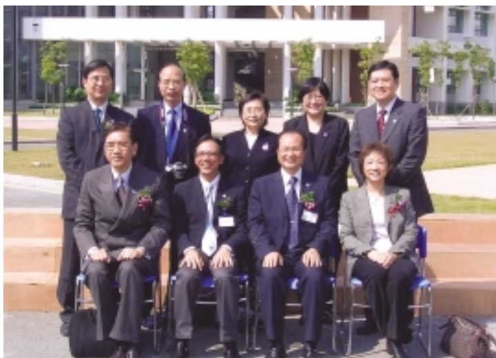
Mission Completed. Smile. 任務完成，拍照留念