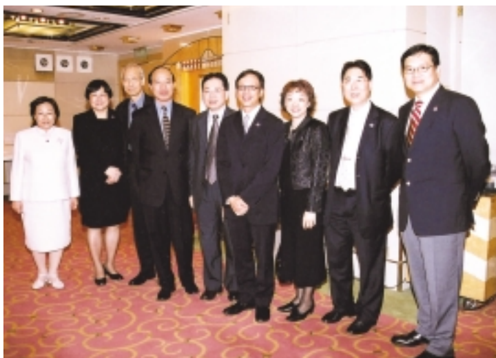
After Annual Dinner 週年晚宴後攝