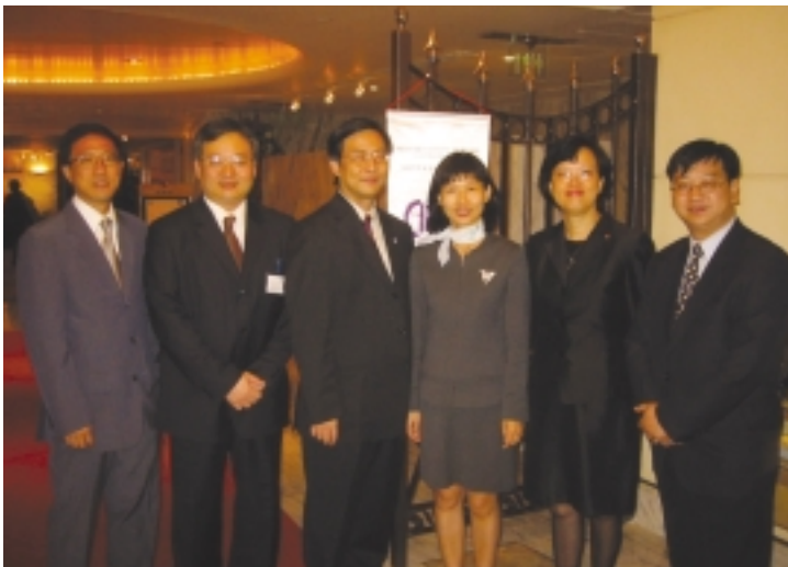
Some Members of the Committee 部份會員