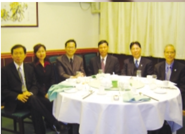
Post-meeting Gathering 會後小聚