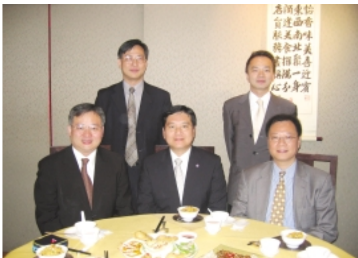
Post-meeting Gathering 會後小聚