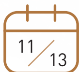
Experiential Tour to The Elderly Resource Centre (2) 房協身歷耆境體驗團(二)