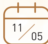
APB 55th Anniversary Conference